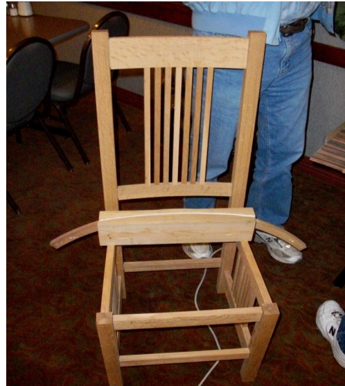
White oak chair