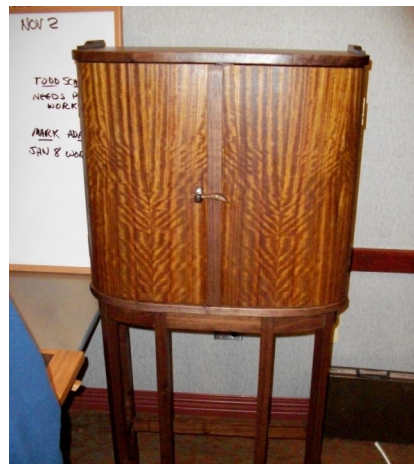
Bow front chest

To sum things up, Roland said the principle would be that anytime you wanted to bend wood there were options (other than steam