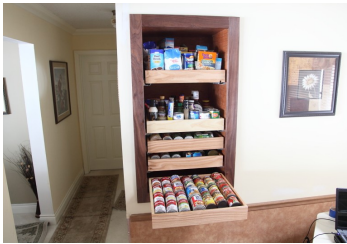
Closet pantry with full length extension slides