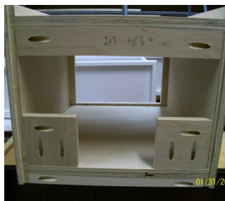
Back of cabinet Showing Drawer Guide Brackets