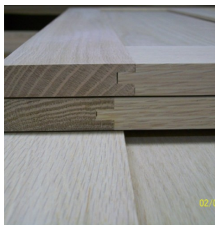
Panel Door Joinery