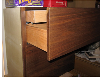
Pencil drawer hidden inside main drawer