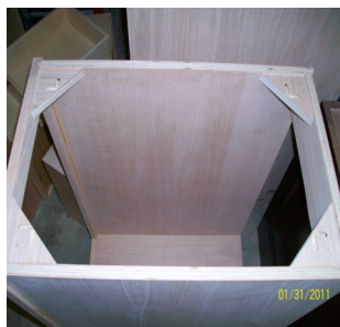
Base Cabinet With Gussets