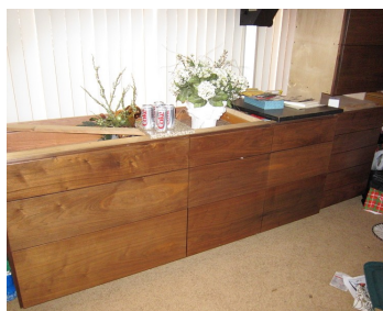
Cabinets with continuous matched grain