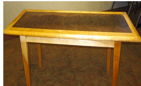
End table with walnut crotch wood top