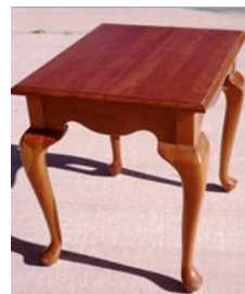
End Table with Cabriole legs