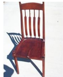
Chair with hip joint construction