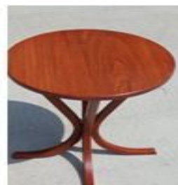
Bent laminated end table